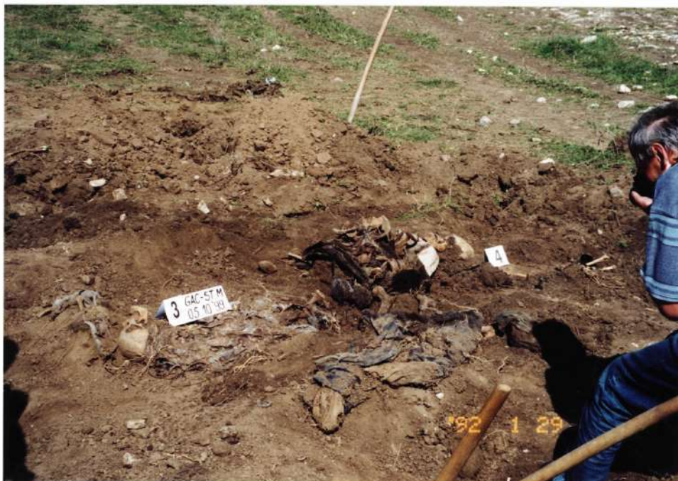
Photo 2. Remains in situ at Site 1a.