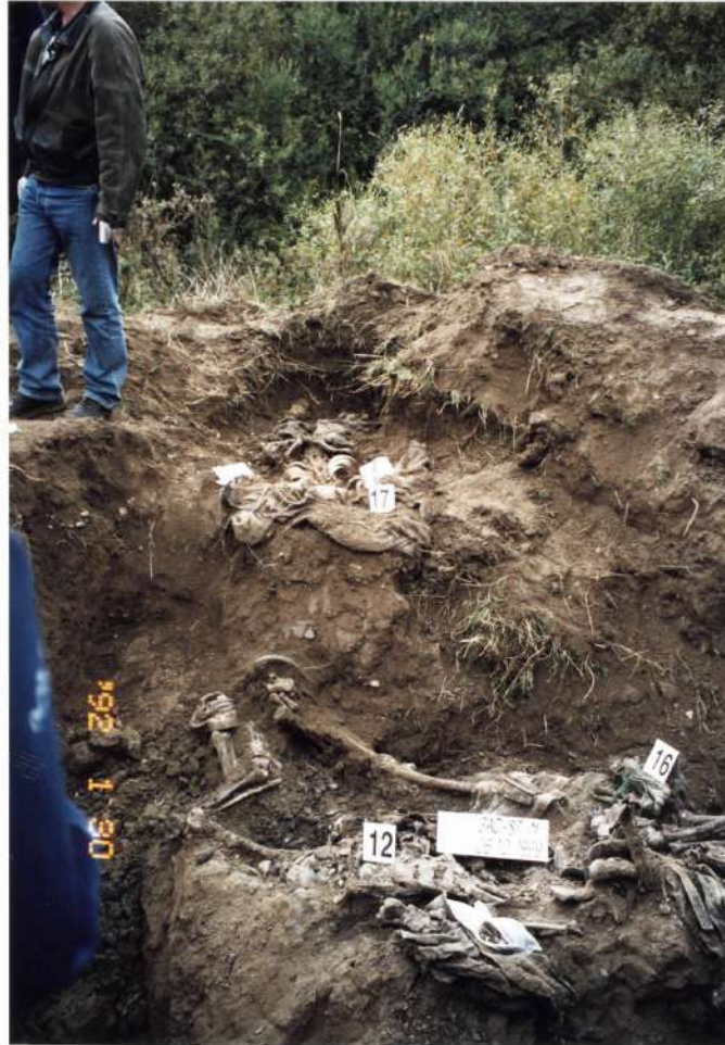
Photo 3. Remains in situ at Site 1b.