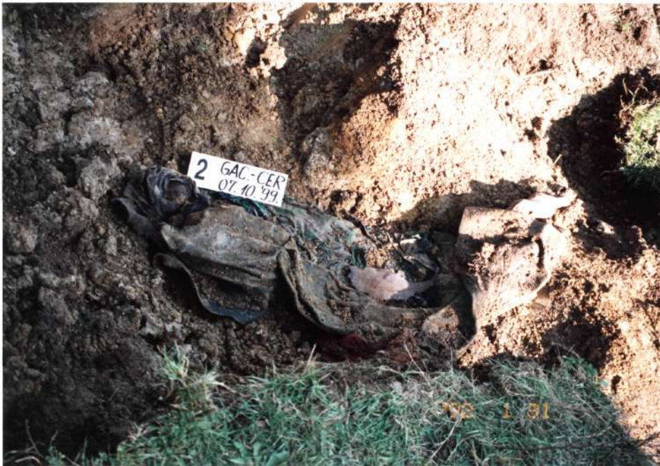
Photo 6. Remains in situ at Site 6.