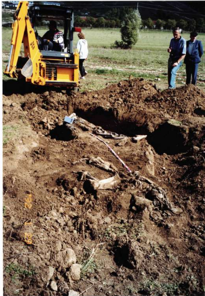
Photo 1. Site 1a exhumation in progress.