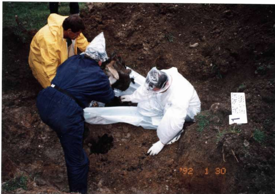
Photo 4. Work in progress at Site 3.