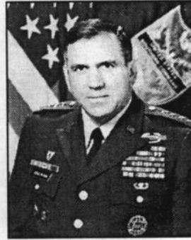
Gen. George Joulwan (Ret.)