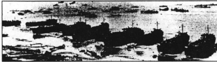
WORLD WAR II COST AMERICA $3.88 TRILLION*

* in 1996 dollars. Source: Statistical Abstract of the U.S., 115th Edition.