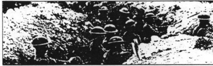
WORLD WAR I COST AMERICA $460 BILLION*