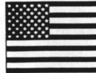
THE UNITED STATES OF AMERICA

IMMEDIATE BENEFITS. EXTENDED COVERAGE. GUARANTEED SECURITY. COMPREHENSIVE PROTECTION. GROUP RATES. A PEACE DIVIDEND.