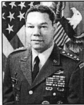
Gen. Colin Powell (Ret.)