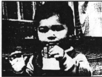
NATO EXPANSION WILL COST EACH U.S. TAXPAYER THE PRICE OF A CANDY BAR.

Source: Administration Report to Congress, Feb., 1997