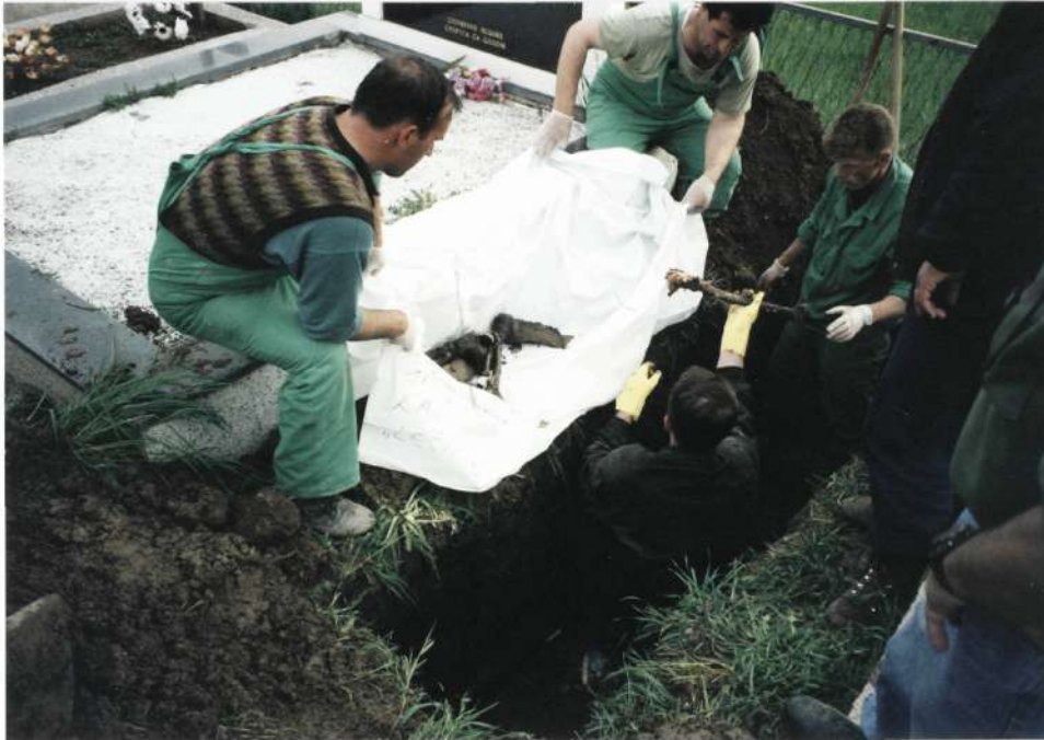
Photo 5. View of Kasindol Cemetery (site five) showing assistants transferring remains from marked grave piecemeal into labeled body bag.