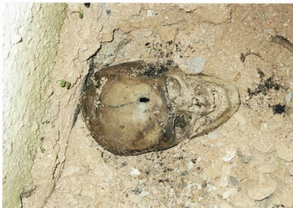
Photo 2. Širokari house (site two)—Skull on floor of north room with gunshot wound of left frontal area.