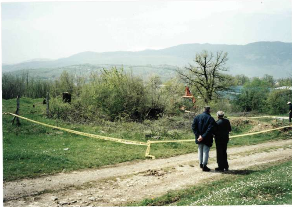
Photo 9. View of Vranješ mass grave (site seven), looking south-southwest, showing area prior to excavation.