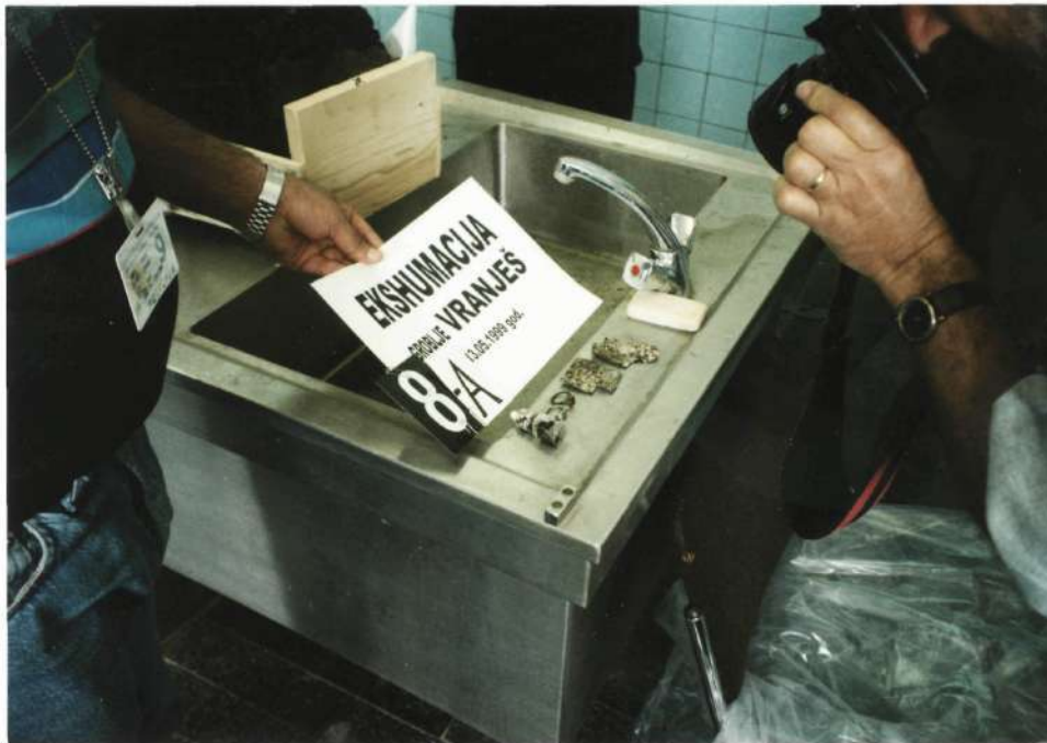
Photo 14. Visoko Cemetery autopsy facility, showing personal items found with remains from Vranješ Cemetery.