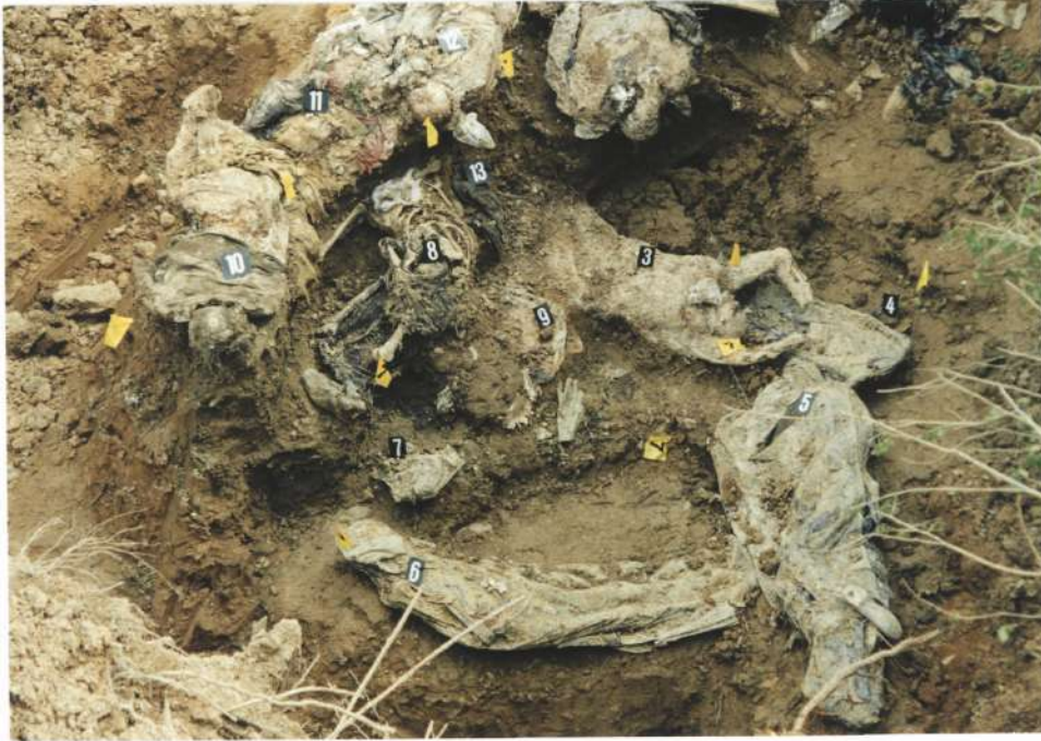
Photo 11. View of Vranješ mass grave (site seven) showing multiple human remains.