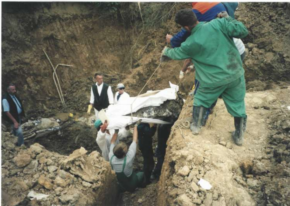
Photo 12. View of Vranješ mass grave (site seven) showing assistants lifting remains in labeled body bag and box from depths of grave to surface.