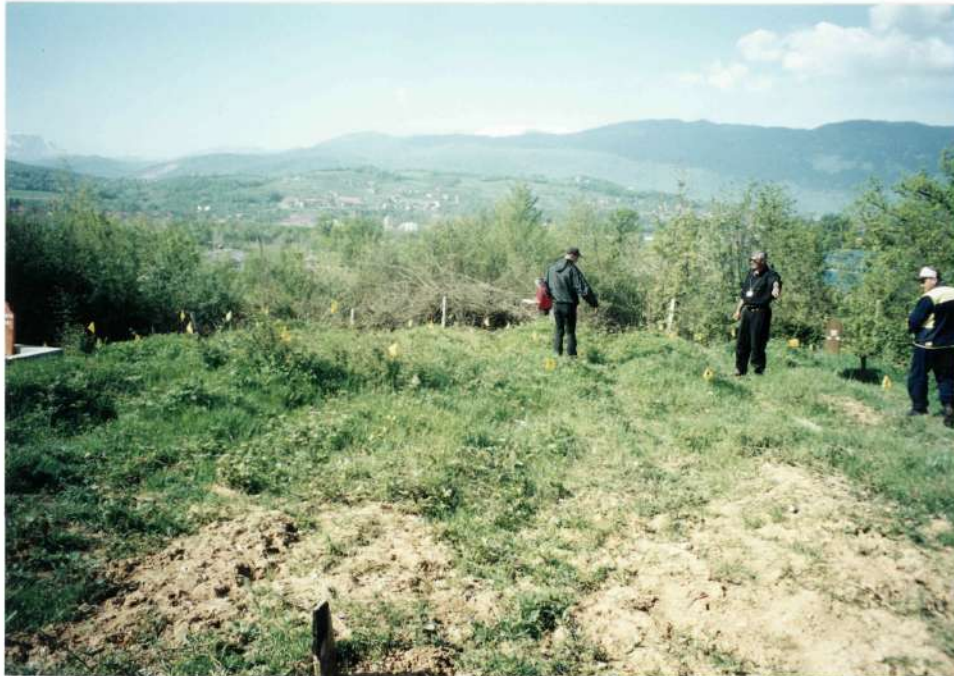
Photo 6. View of Vranješ Cemetery (site eight), looking south-southwest, showing multiple unmarked graves.