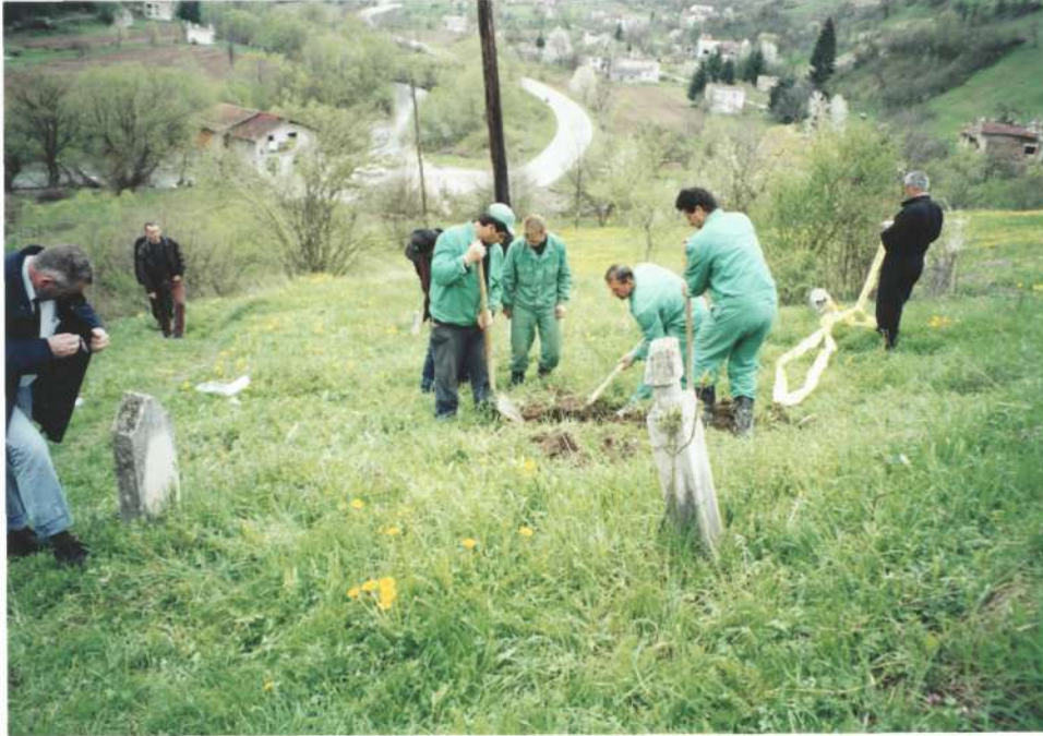
Photo 3. View of Kijevo-Turbe Cemetery (site four), looking south-southeast, showing workers beginning to remove gravefill from unmarked grave reported to contain multiple human remains.